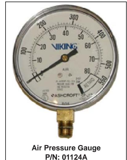
Air Pressure Gauge P/N: 01124A