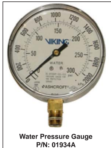
Water Pressure Gauge P/N: 01934A