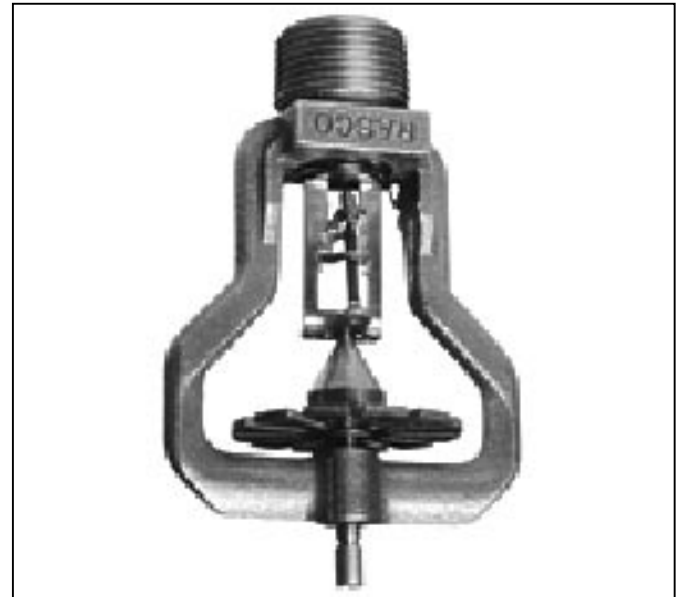
Model H ESFR Sprinkler

The deflector and frame provide a broad, very symmetrical, hemispherical pattern capable of suppressing fires between sprinklers in high storage height areas and at the same time retaining a high momentum central core to penetrate and suppress fires occurring directly beneath the sprinkler in low storage height areas.