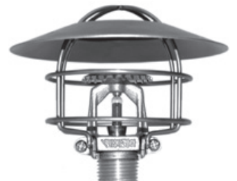
Upright Intermediate Level Sprinkler (with Guard and Water Shield)

Order Water Shield Separately. (Field Assembly Required.) See Installation Instructions.) Order Sprinkler Guard Separately or Factory Installed. (See Ordering Instructions.)