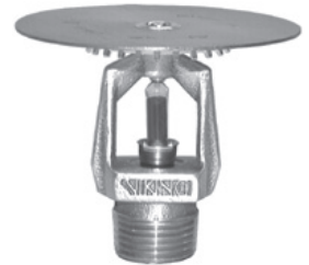
Upright Intermediate Level Sprinkler (Factory pre-assembled only)

Viking Technical Data may be found on The Viking Corporation's Web site at http://www.vikinggroupinc.com . The Web site may include a more recent edition of this Technical Data Page.